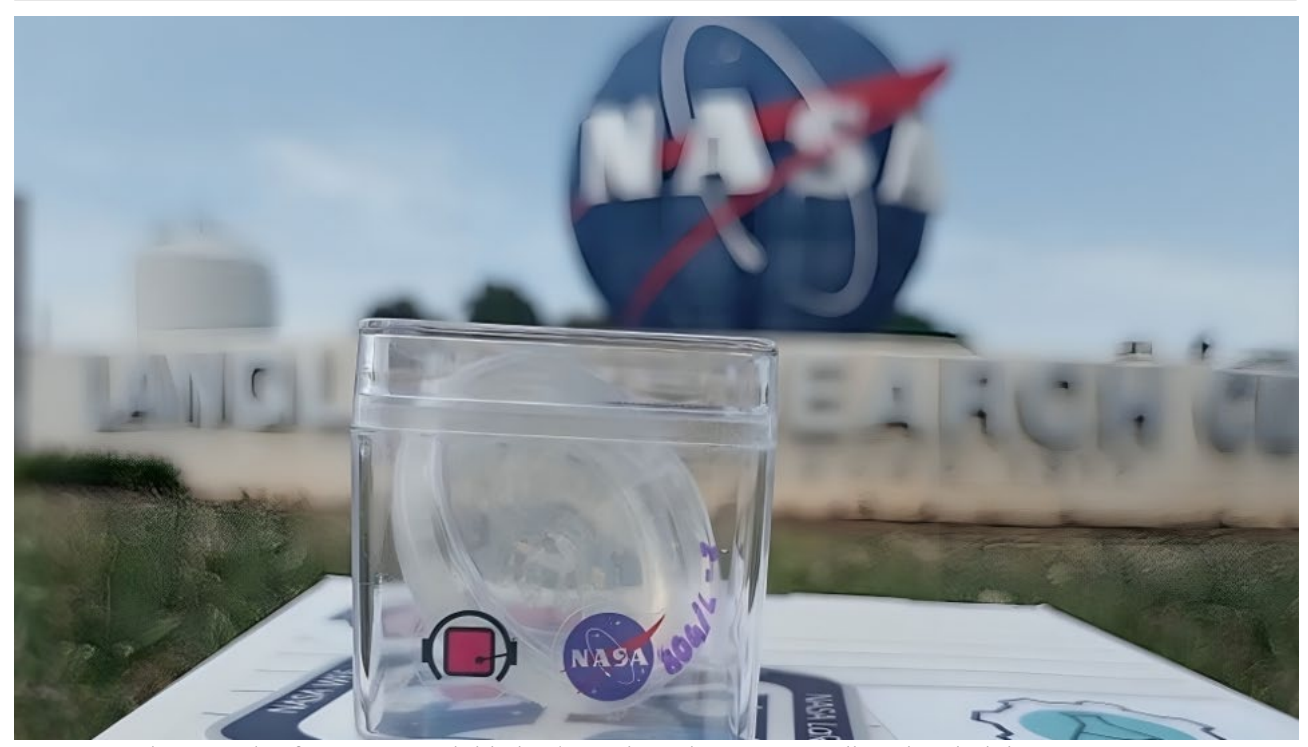
Figure 3. Photograph of our BECAP initiative bacteria at the NASA Wallops in Virginia

Although a prominent academic and industrial spectrum of interest in STEM careers exists, access to higher education in Colombia is still a challenge. Although higher education is one of the main drivers of a country's economic and social development, more opportunities in this area are needed for the current population. For this reason, Colombia encourages women to study STEM careers and reduce gender inequality in education. To this end, several programs have been created that offer scholarships to encourage women's extraordinary potential in science. Today there are several opportunities to study, such as the Women in STEM Scholarships, which is a program led by the Ministry of National Education and the Colombian Institute for the Promotion of Higher Education, which seeks to provide scholarships for women in undergraduate programs in STEM in public and private universities. The scholarship covers up to 100% of tuition and is awarded per semester. BECAP plans to connect with the industry to obtain undergraduate scholarships for young women to motivate them to study STEM-focused careers and achieve their dreams. An example of what has been achieved is to generate two scholarships for these girls with the Mayagüez Sugarcane company, which financed the girls' college tuition, food, and transportation.