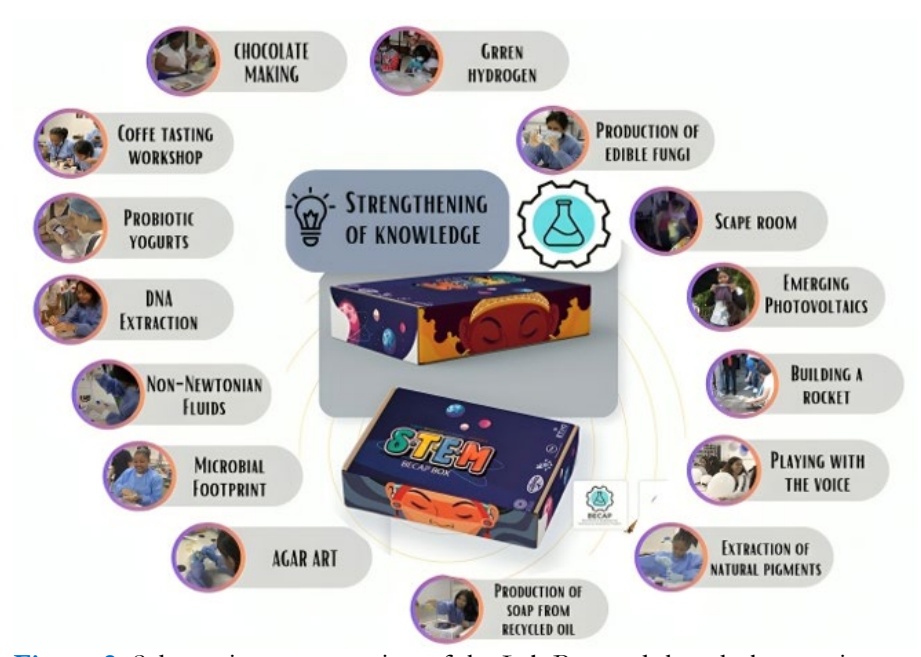
Figure 2. Schematic representation of the Lab Box and the whole experiments that have been carried out by the BECAP initiative

science and technology careers with a unique and valuable perspective. The result is a new generation of women leaders in STEM with a solid scientific foundation, a deep respect for ancient wisdom, and the ability to apply it innovatively in the modern world. The following is a brief description of the experiments (also illustrated in Figure 2):