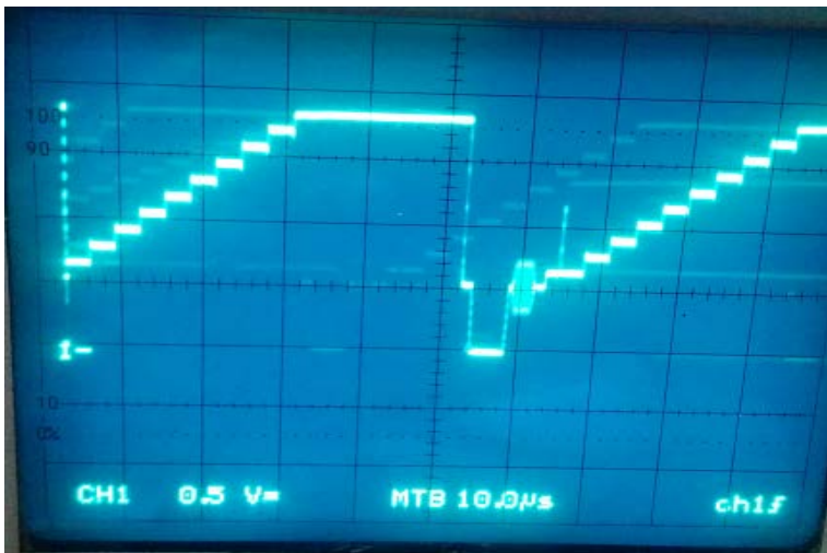
Figure 2. Composite signal pattern waveform