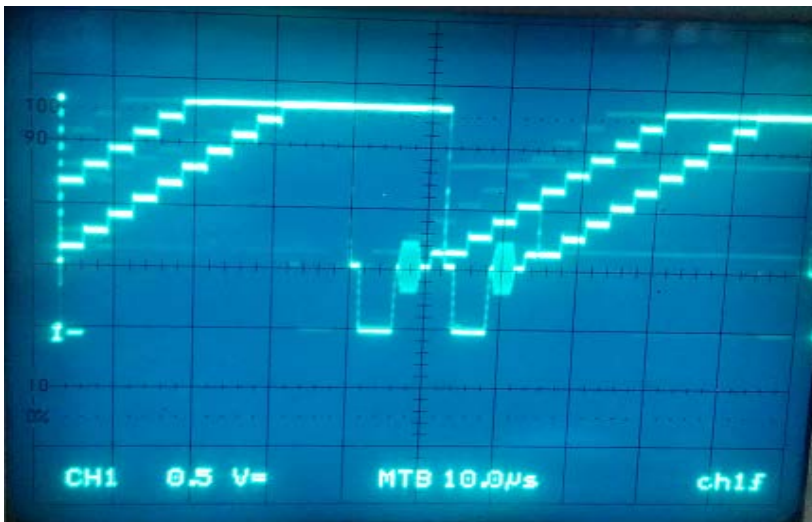
Figure 3. Distorted composite signal

Figure 3 represents waveforms of the distorted Composite Step Signal (Lee et al., 2008). The waveform at the final stage is compared with the waveforms of Composite Step Signal Generator at the point of transmission (Tanaka, 2006). The comparative analyses shows that the signal constituents at the final stage is affected by the ghost image of Composite Step Signal. The presence of ghost signal alters the standard signal components from its actual values to a new distorted values (Peiravi and Toosizadeh, 2009). These new values acquired by the Step Composite Signal corrupts the actual signal/information transmitted (Harada and Oritake, 1982). The noise in the signal produces undesirable effects on the final results of the signal. Thus the motive to transmit the information is lost (Hooper and Sunnyvale, 1986). The analyses of waveforms on an oscilloscope reveals the type and characteristics of noise (Punchihewa, 2003). The analysis of Step waveforms indicates that peak to peak amplitude of the Composite Step Signal has not changed. It is also being noticed that the pulse width of the signal also remains unchanged. The observations help to select the effective method for noise reduction.