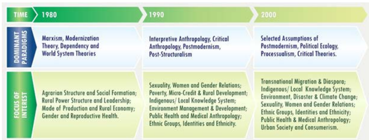
Figure 1. The transformation of research interests in Anthropology of Bangladesh from 1980 to 2010