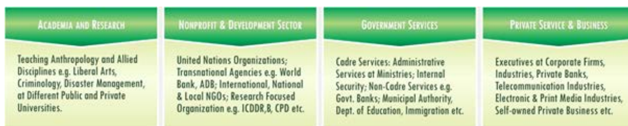
Figure 3. Major employment for Anthropology graduates in Bangladesh

to poverty, livelihood and development. Apart from the major research areas graphed above, students of all the universities have also conducted research on issues like gerontology, film and media, folklore, historical construction, tourism industry, ship-breaking industry etc. which have been grouped under a separate category titled as ‘other’.