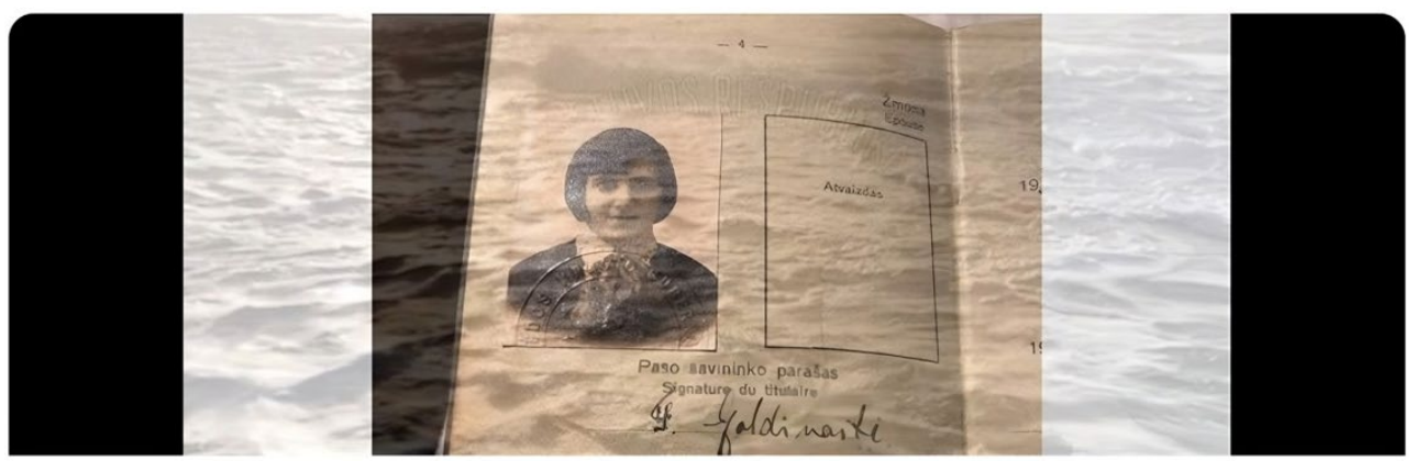
Figure 5. Jewish refugee voyages to the South. Screenshot from Oceanic Swimming | writing | thinking for justice-to-come scholarship.