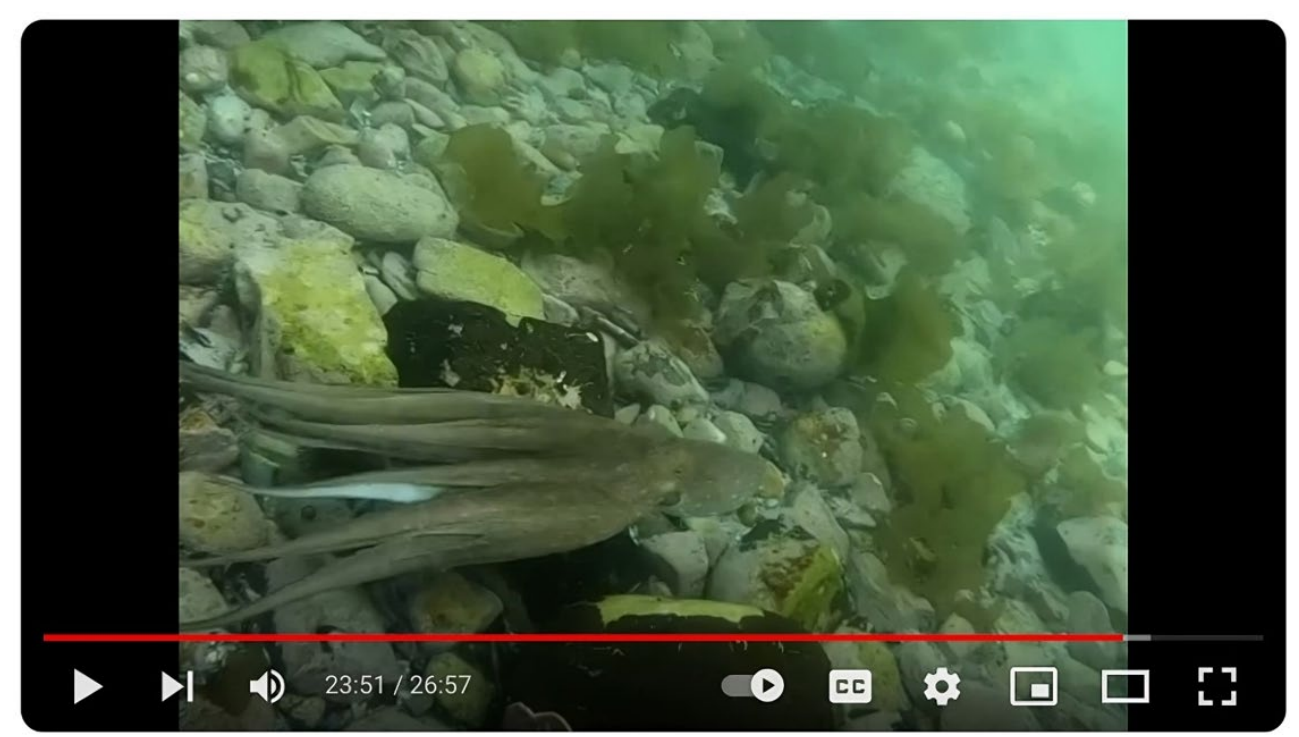
Figure 3. Octopus pursuing cormorant. Screenshot from Oceanic Swimming | writing | thinking for justice-to-come scholarship.