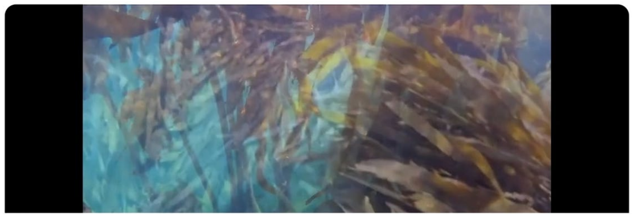
Figure 1. <sup>5</sup>African kelp sea forest. Screenshot from Oceanic Swimming | writing | thinking for justice-to-come scholarship. © Nike Romano, Vivienne Bozalek and Tamara Shefer

an intimate encounter, where we feel our shared vitalities and entanglements as poignantly as the kelp that winds around us and that offers a moment of stability in wild seas.