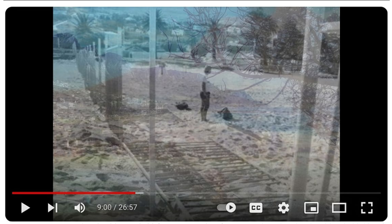
Figure 4. Camps Bay beach with apartheid fence. Screenshot from Oceanic Swimming | writing | thinking for justice-to-come scholarship.

circling them like sharks. Whether it is just a mild irritation or when the humans come too close whether they are seen as a threat, Here am I trying to interpret or anthropomorphise the feelings of the octopus just after castigating that type of behaviour. But we humans are full of contradictions swaying this way and that, justifying our moves along the way.