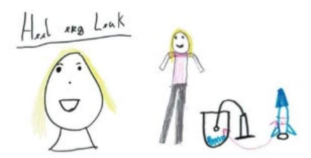
Figure 2. One pupils' drawings showing emotion during the IBSE activity [Note: The statement above the drawing can be translated as "very much fun"]

On the other hand, the main weakness mentioned by the participants is that the drawings were often unclear and not specific enough for the participants to know how to improve their pedagogical skills.