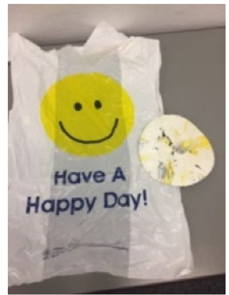
Figure 2. Plastic bag before and after