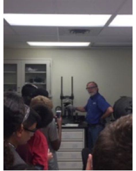
Figure 1. Campers visiting the polymer recycling lab