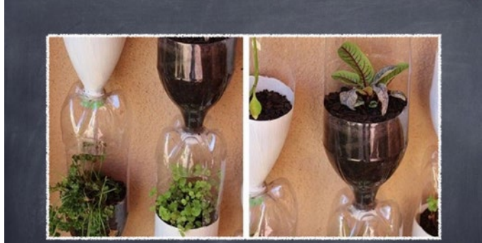
Using everyday objects like plastic bottles can be reused instead of being trashed.

Figure 5. Campers recycled garden design concept presentation