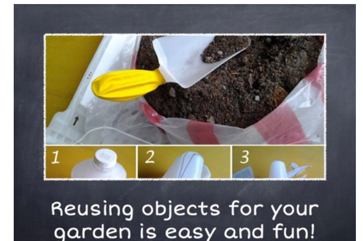
Figure 6. The fun factor of the recycled garden design concept presentation

Figure 5. Campers recycled garden design concept presentation