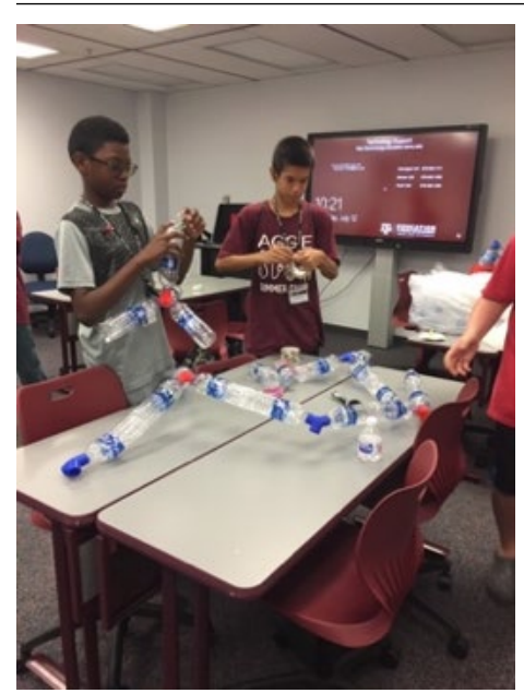
Figure 4. Campers using connectors and bottles to design a 3D shape

class. On the fifth and last day, campers presented a mock sales presentation to a group of hypothetical investors comprised of their peers and instructors. These investors could choose to fund or invest in the campers' product, which the campers could make in the future from recycled plastic filament.