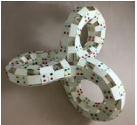
Figure 3. Example of a triple torus structure

The bags they had cut up previously were placed in a convection oven and heated to the processing temperature. The instructor demonstrated how the material was soft and flowable and could be shaped. Each charge of polymer melt was placed in a manual hydraulic press and turned into thick, flat panels. The campers could observe how the printing and colors on the bags remained and moved as the polymer flowed into its new shape. Further, campers could see the thin, flexible bags become rigid and strong sheets when consolidated into thick plates (see Figure 2).